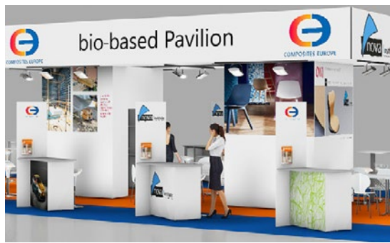
Example layout subject to modification.

Become part of the 'bio-based composites' pavilion. The shared stand is centrally located in the fiber area in Hall 7, Stand A45.