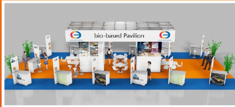
Example layout subject to modification.